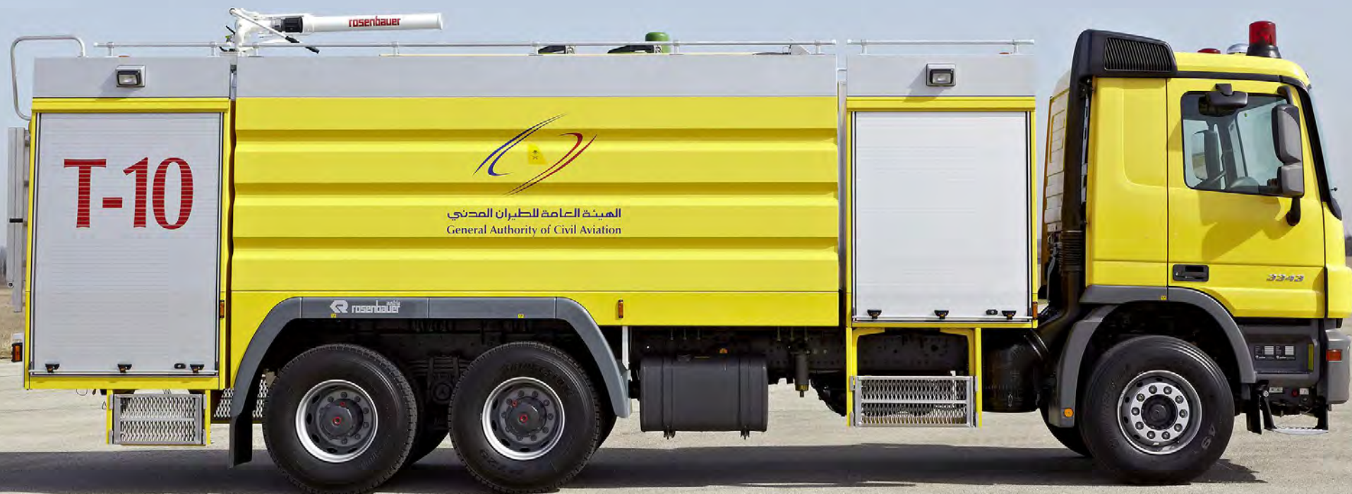
CBS Watertanker · GACA/Saudi Arabia