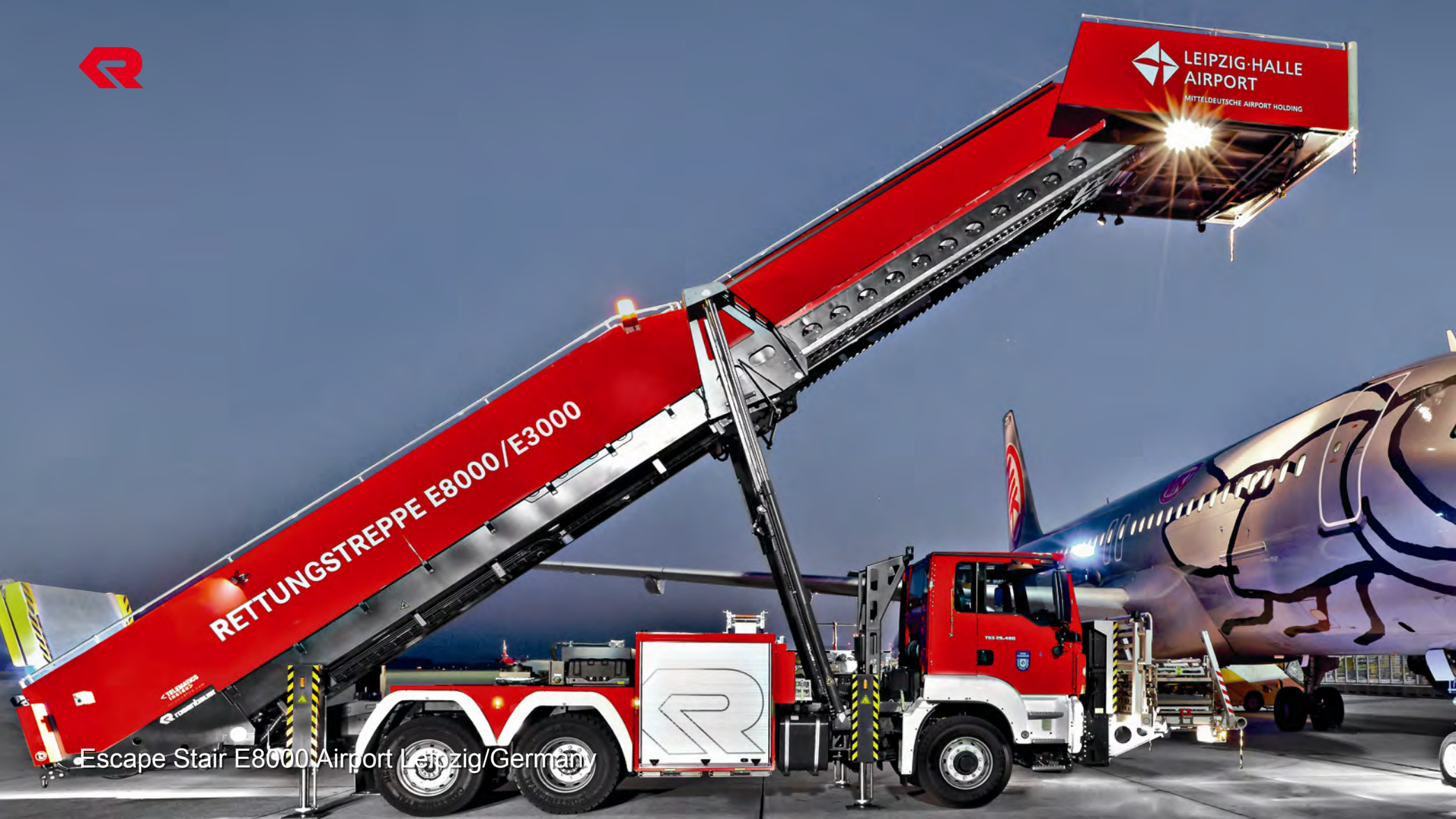
Escape Stair E8000 Airport Leipzig/Germany