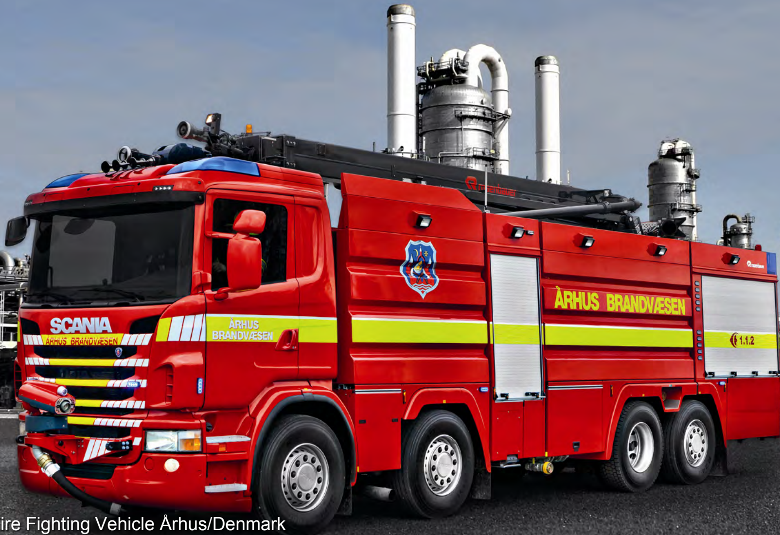
Industrial Fire Fighting Vehicle Århus/Denmark