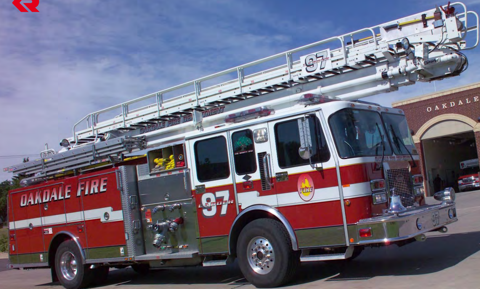
Aerial · Oakdale, Minnesota/USA