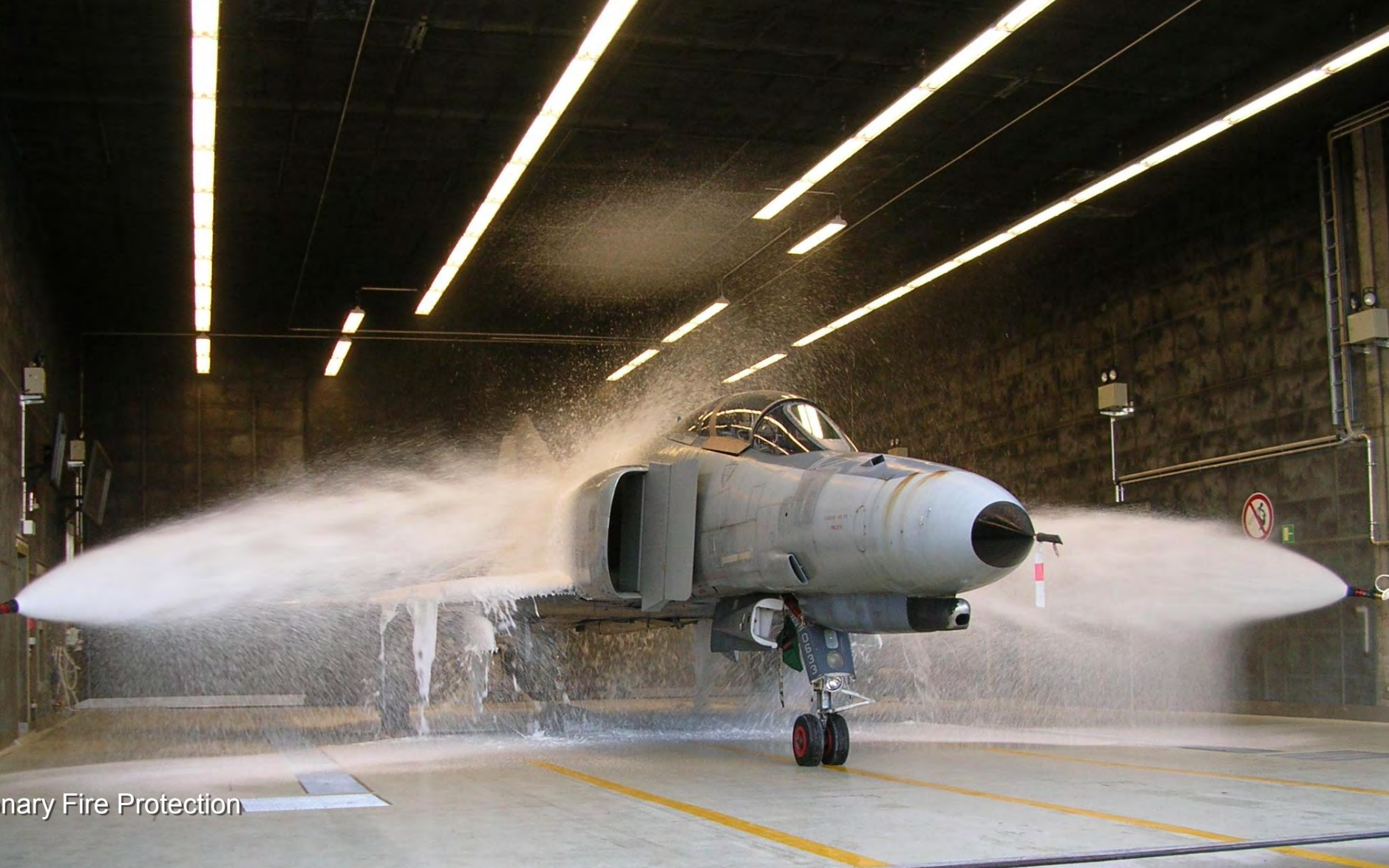
Stationary Fire Protection