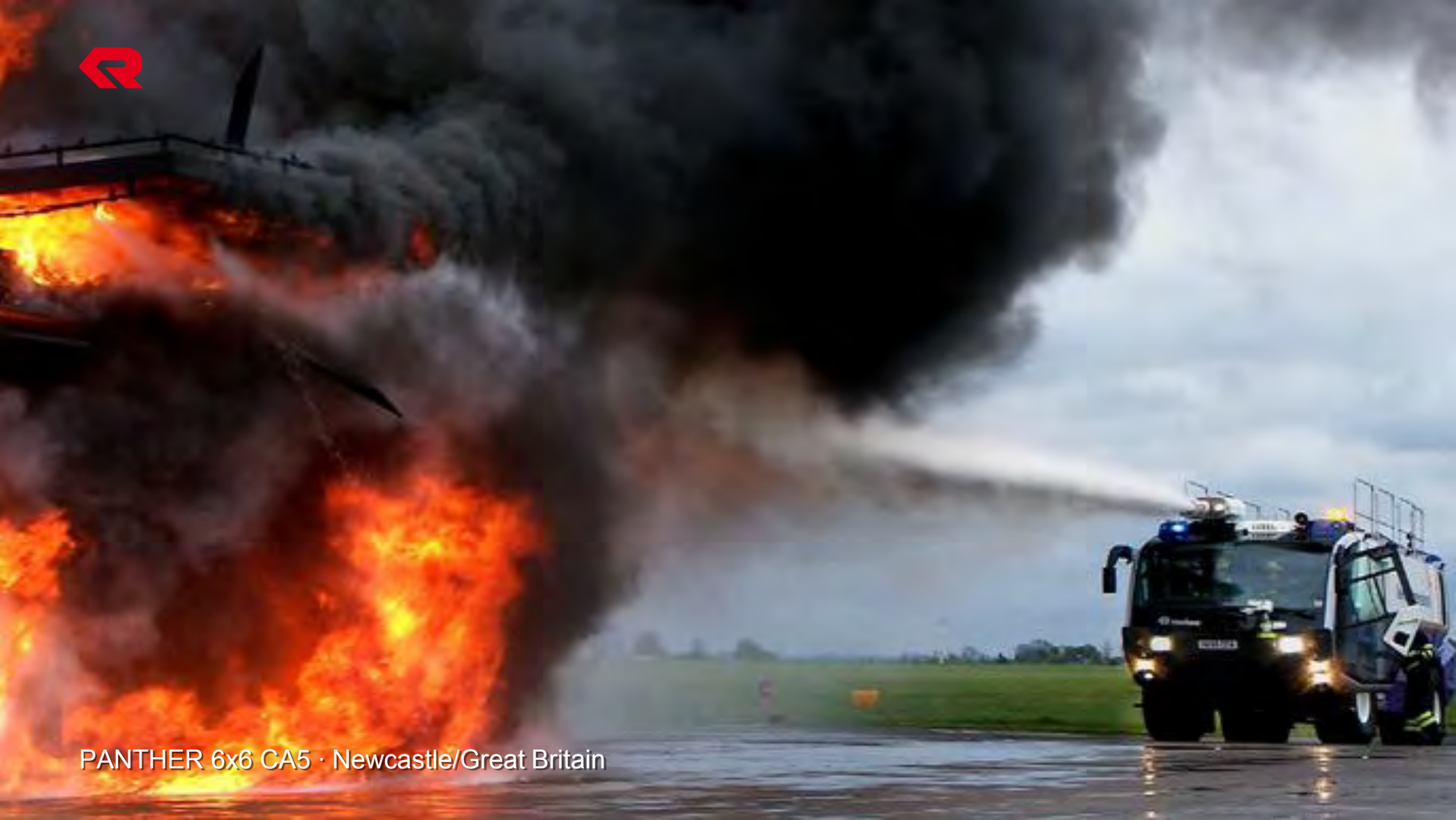
PANTHER 6x6 CA5 · Newcastle/Great Britain