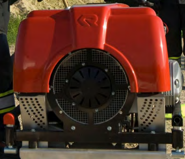
Rosenbauer Portable Pump FOX