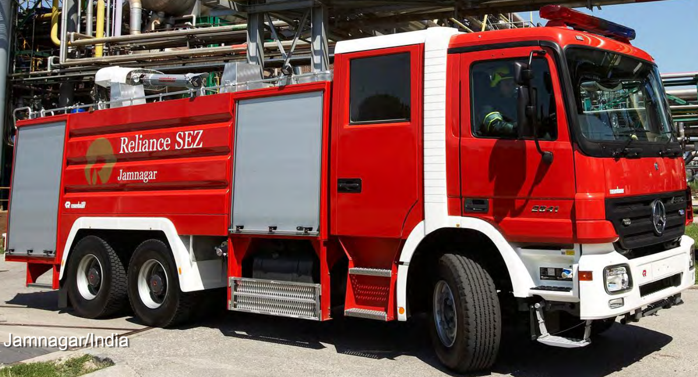
ULF · Jamnagar/India