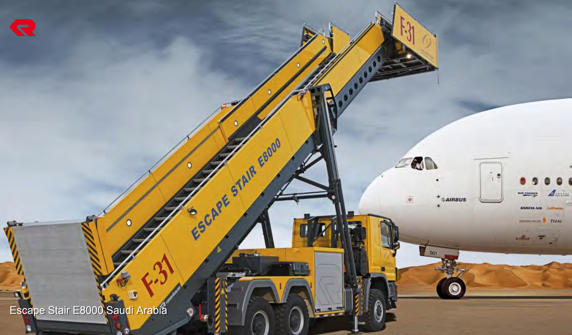
Escape Stair E8000 Saudi Arabia