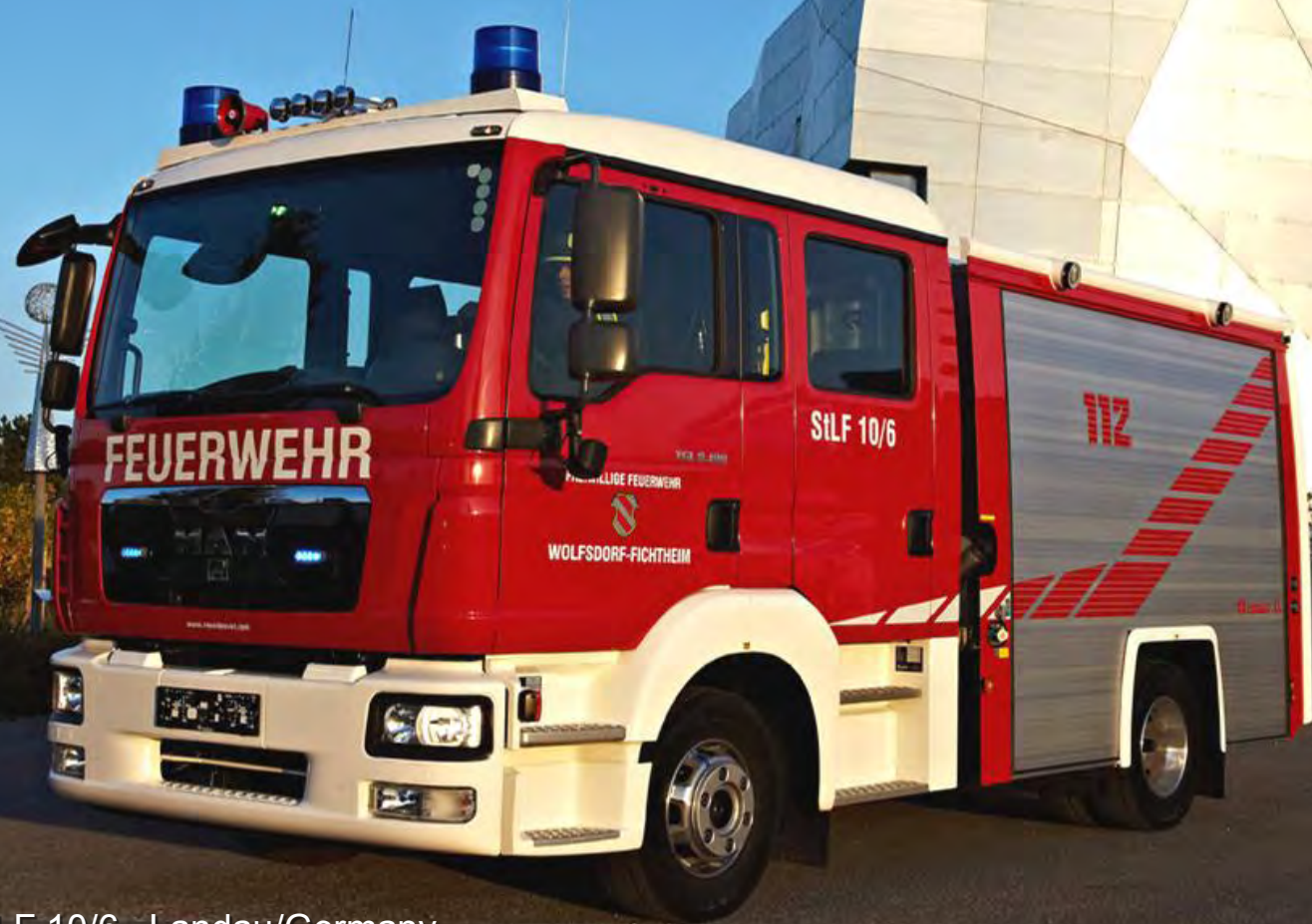
CL StLF 10/6 · Landau/Germany