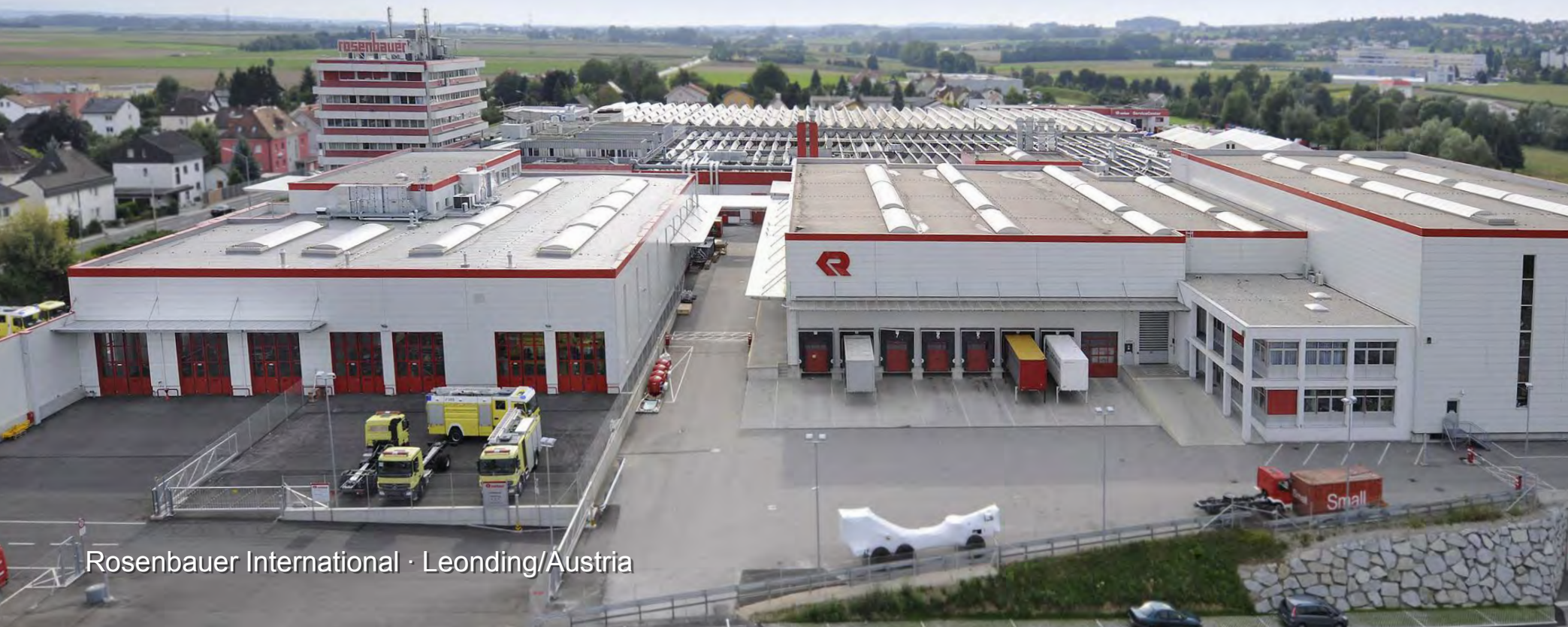
Rosenbauer International · Leonding/Austria