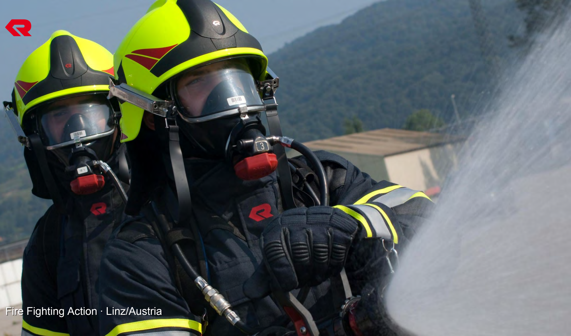
Fire Fighting Action · Linz/Austria