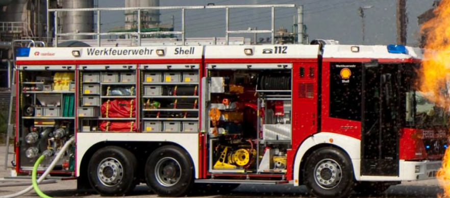
Industrial Fire Fighting Vehicle HLF 3000 · Shell/Germany