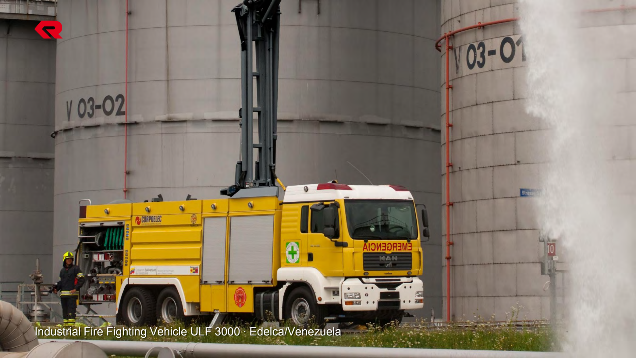
Industrial Fire Fighting Vehicle ULF 3000 · Edelca/Venezuela