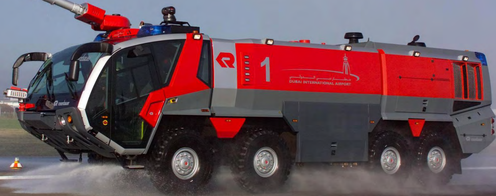
PANTHER 8x8 MA5 · Dubai/VAE