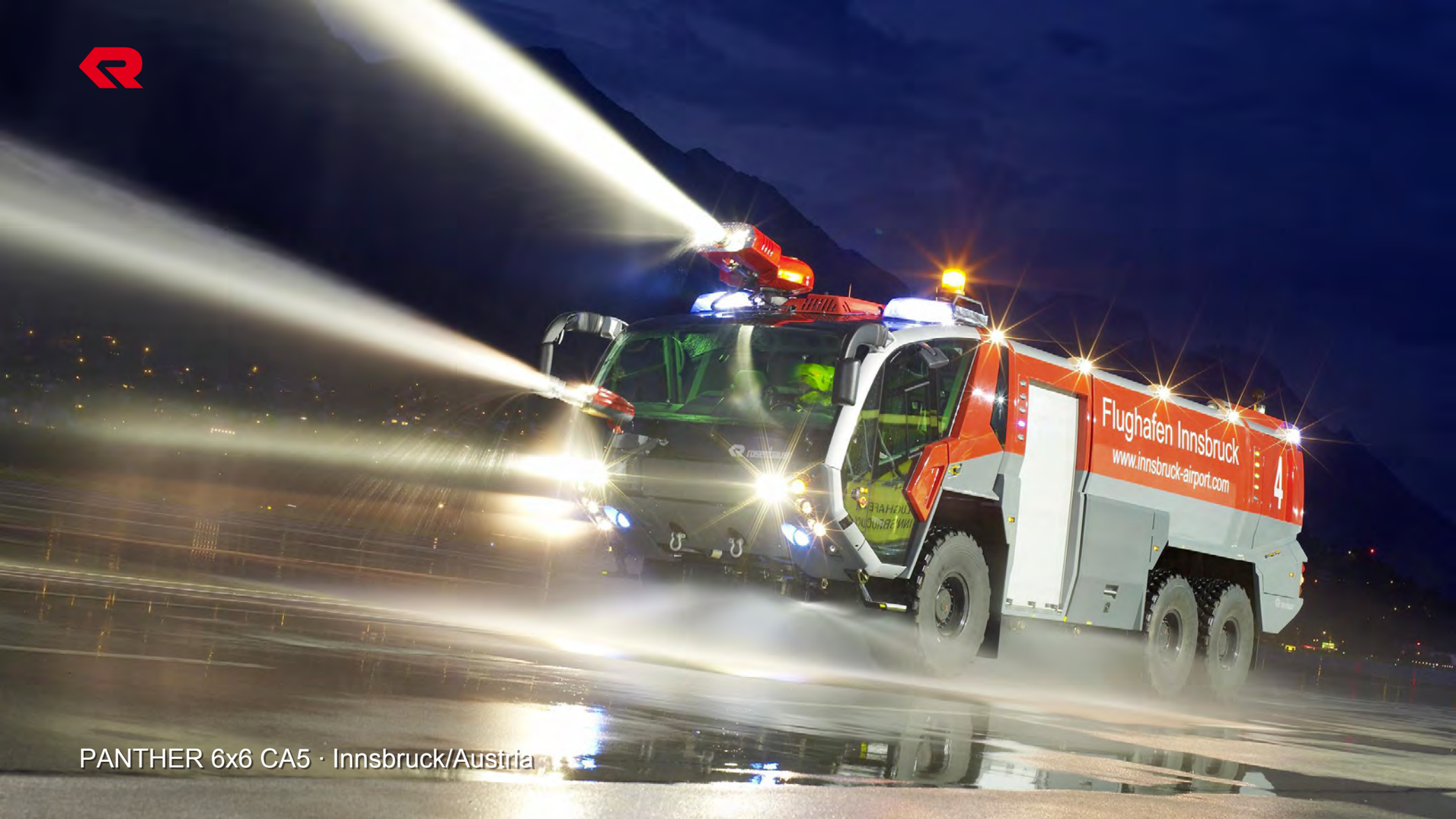
PANTHER 6x6 CA5 · Innsbruck/Austria