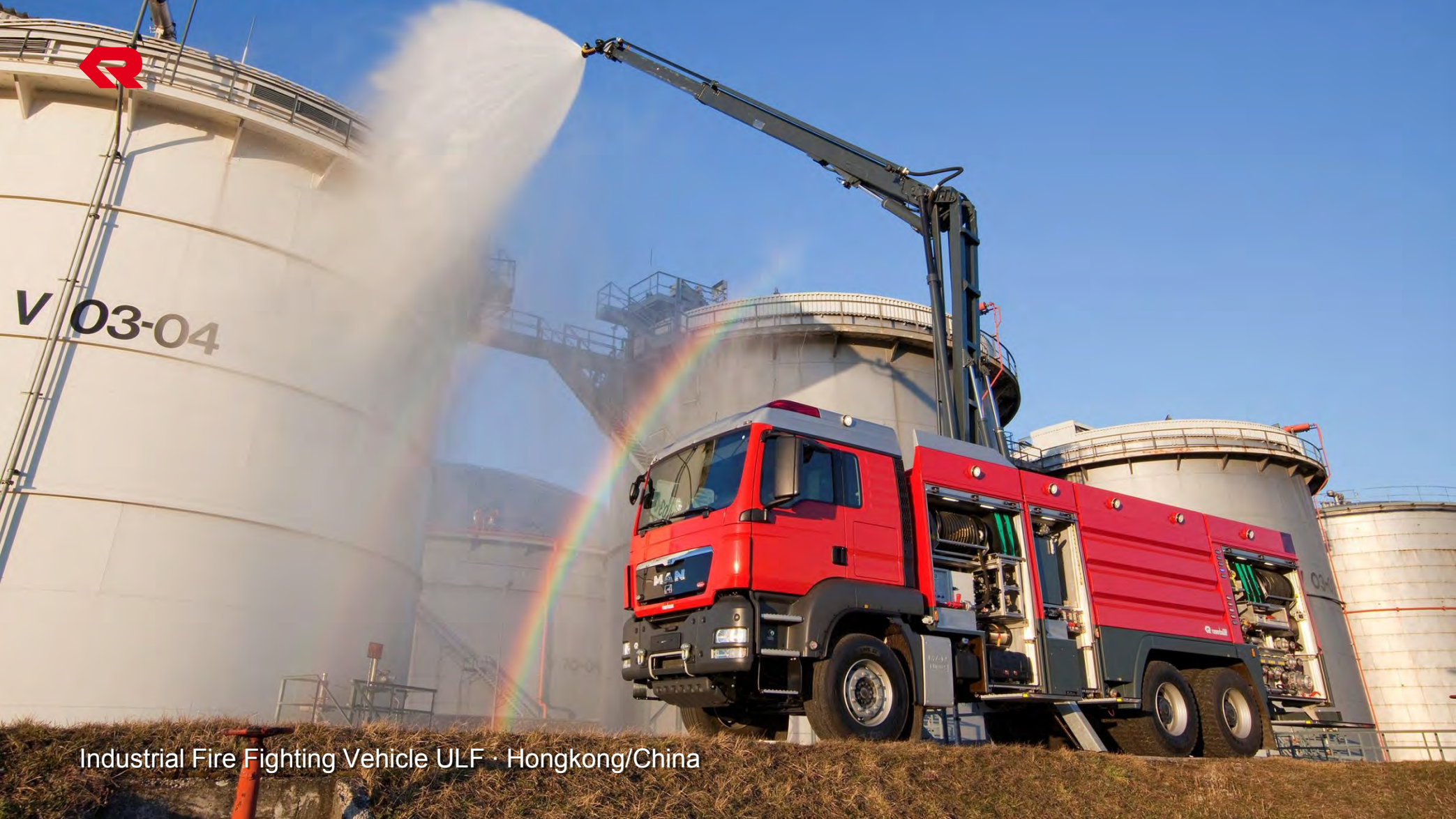
Industrial Fire Fighting Vehicle ULF · Hongkong/China