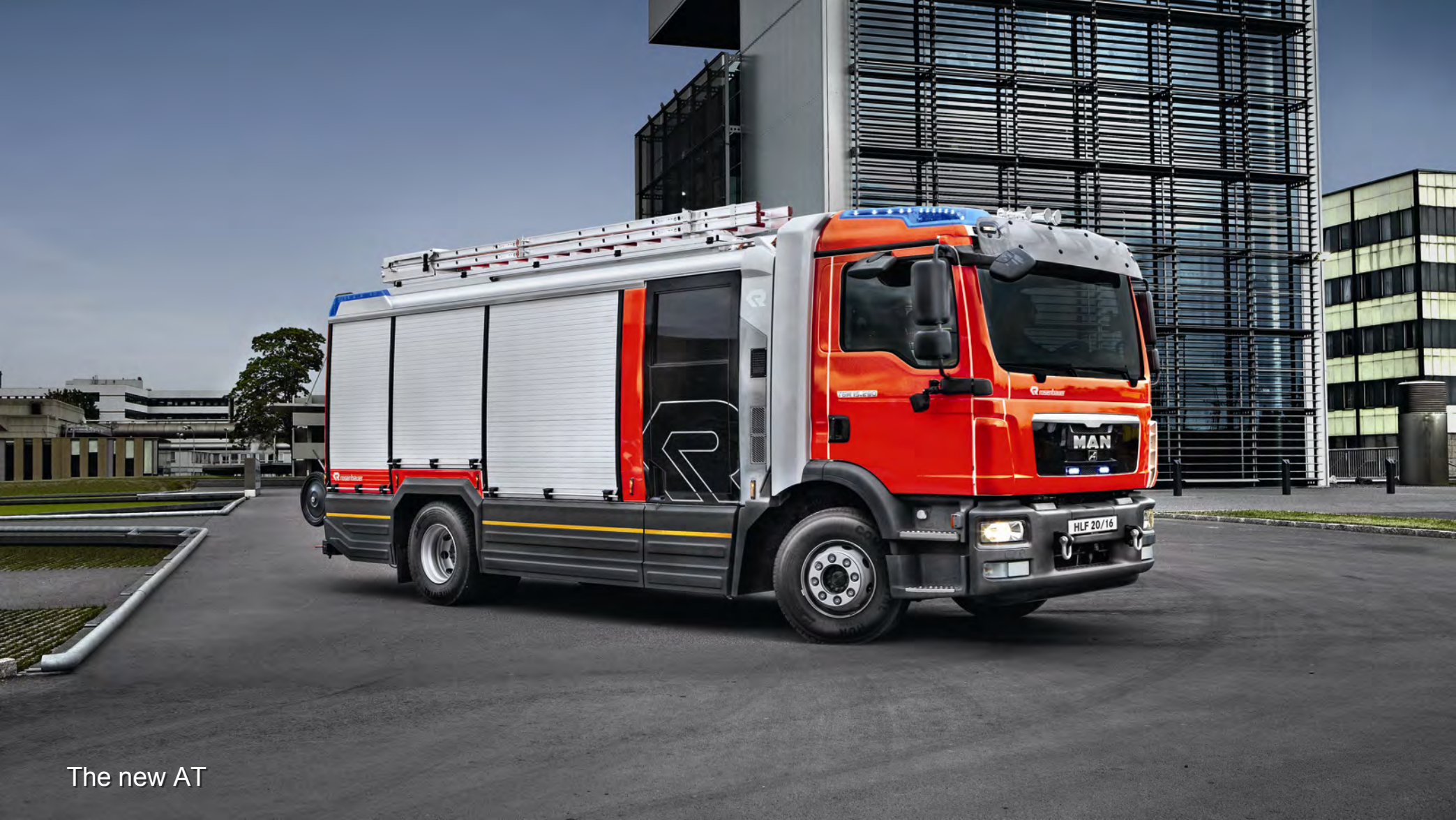
The new AT