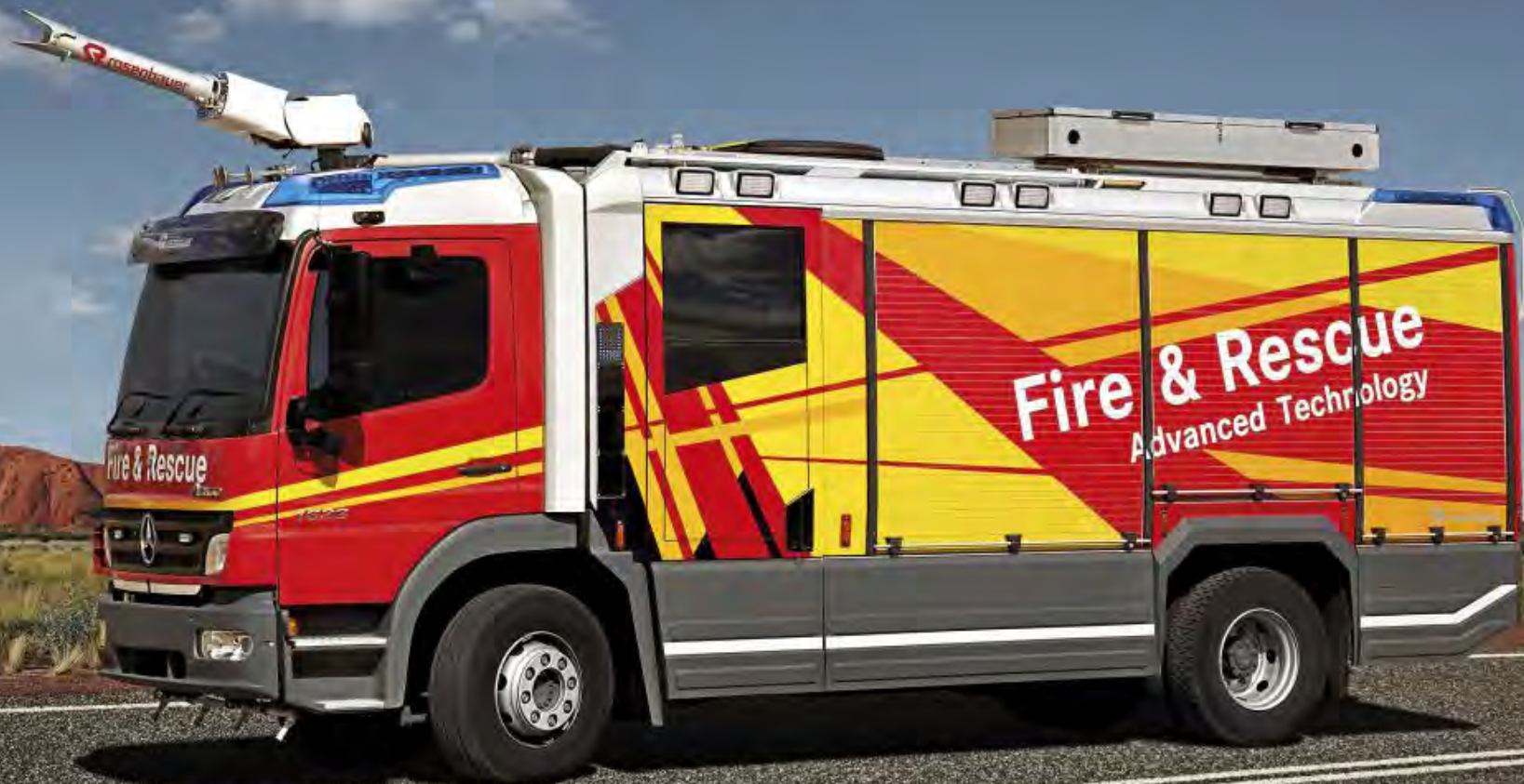
The new AT