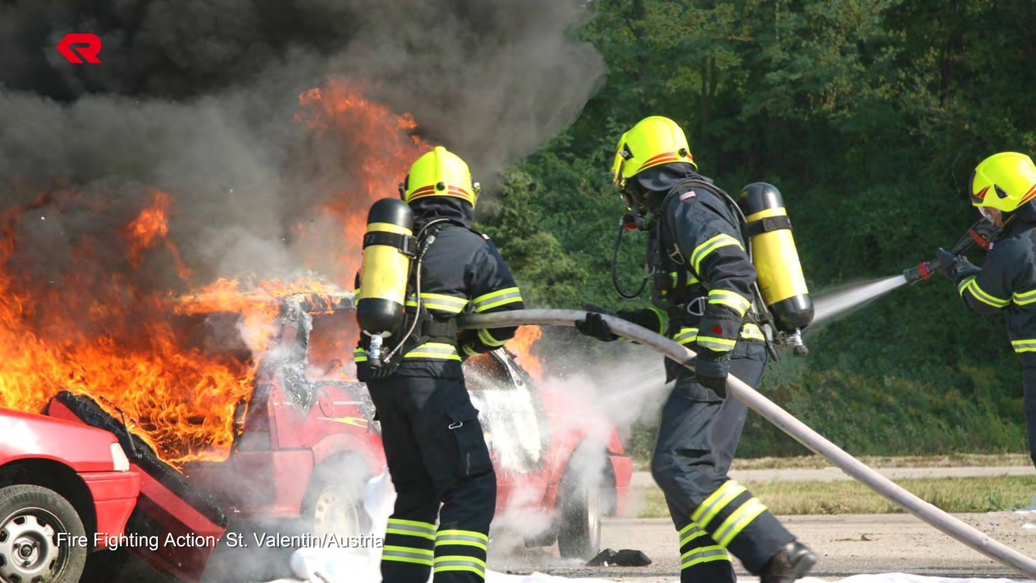
Fire Fighting Action - St. Valentin/Austria