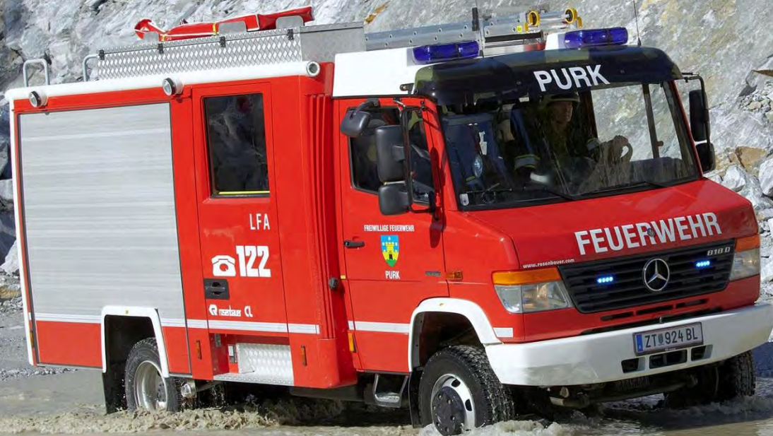
CL LFA · Purk/Austria