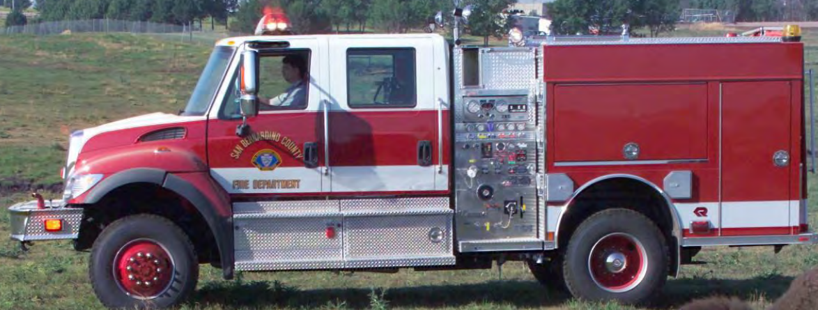
Commercial Pumper · Lyons, South Dakota/USA