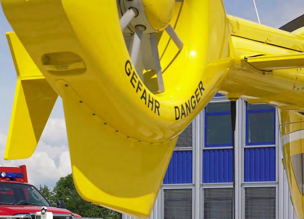
RIV on Ford for Royal Flight · Sultanate of Oman