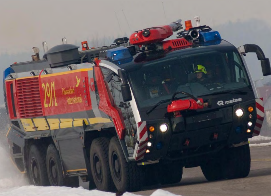
PANTHER 8x8 CA7 · Düsseldorf/Germany