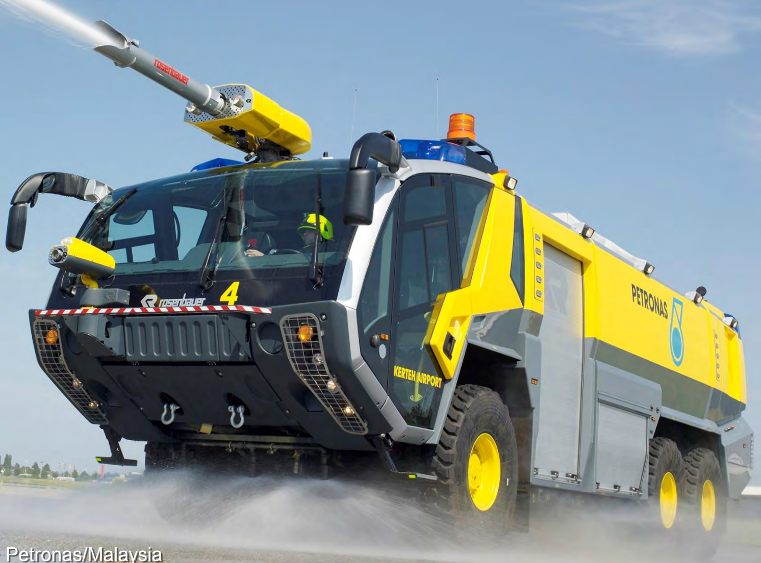
PANTHER 6x6 CA5 · Petronas/Malaysia