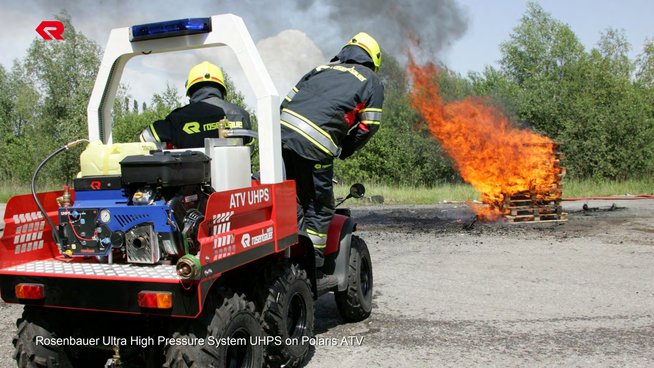
Rosenbauer Ultra High Pressure System UHPS on Polaris ATV