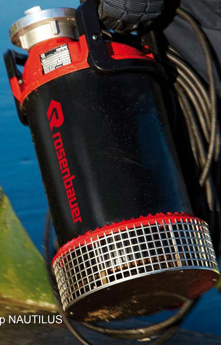
Submersible Pump NAUTILUS