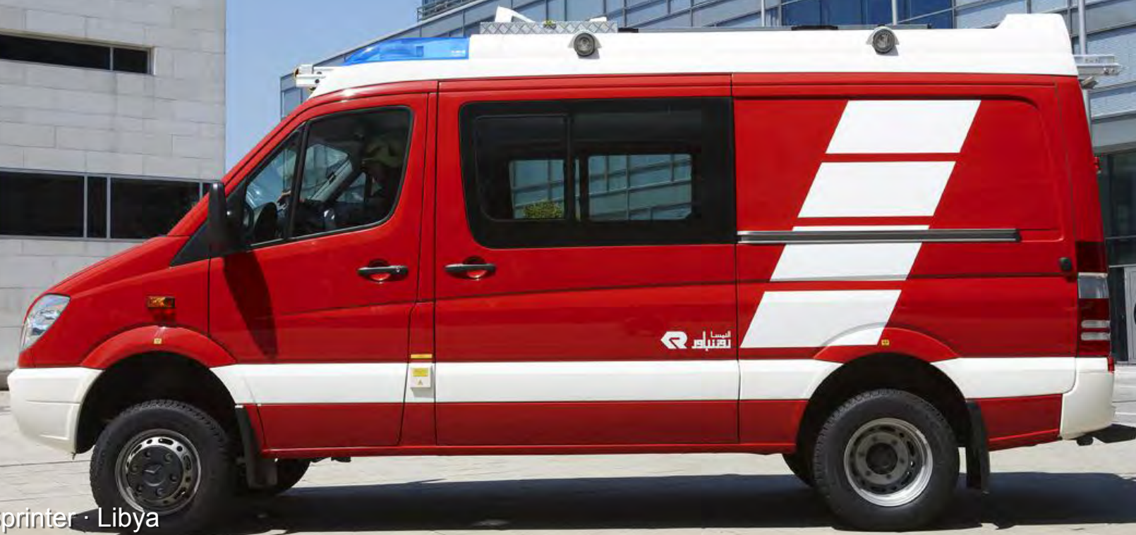
CL Sprinter · Libya