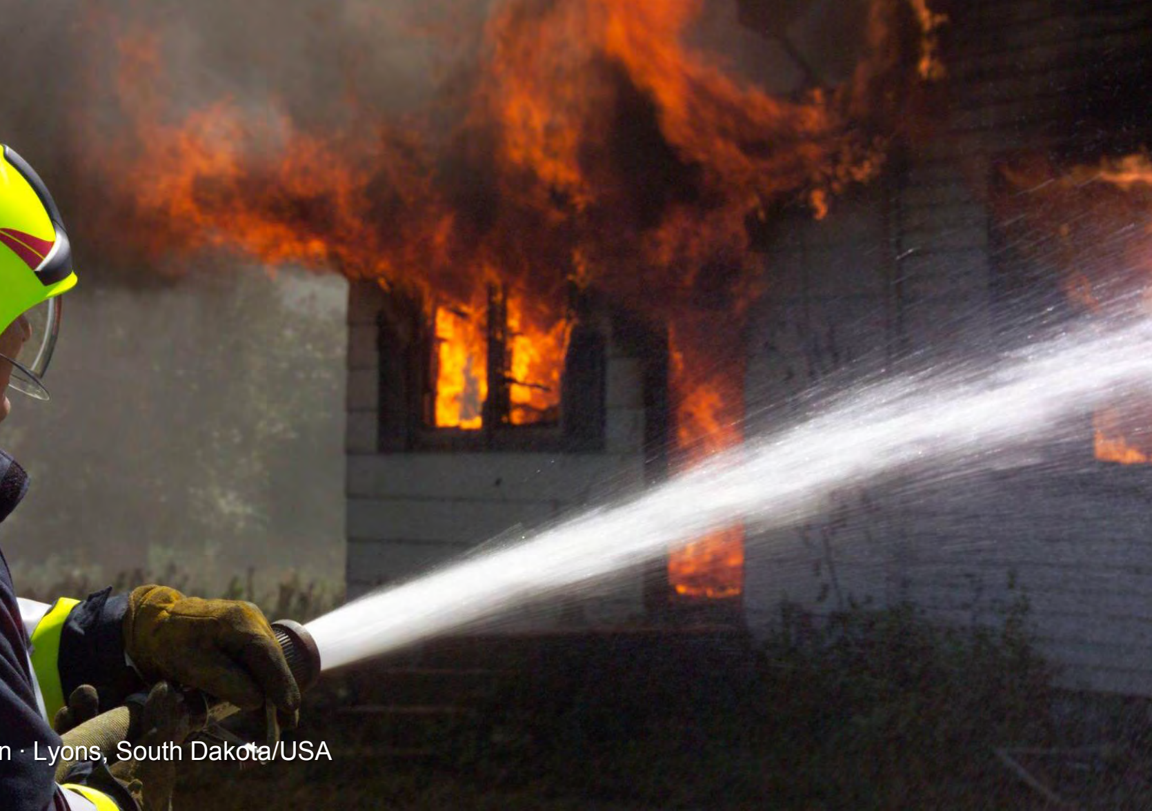
Fire Fighting Action · Lyons, South Dakota/USA