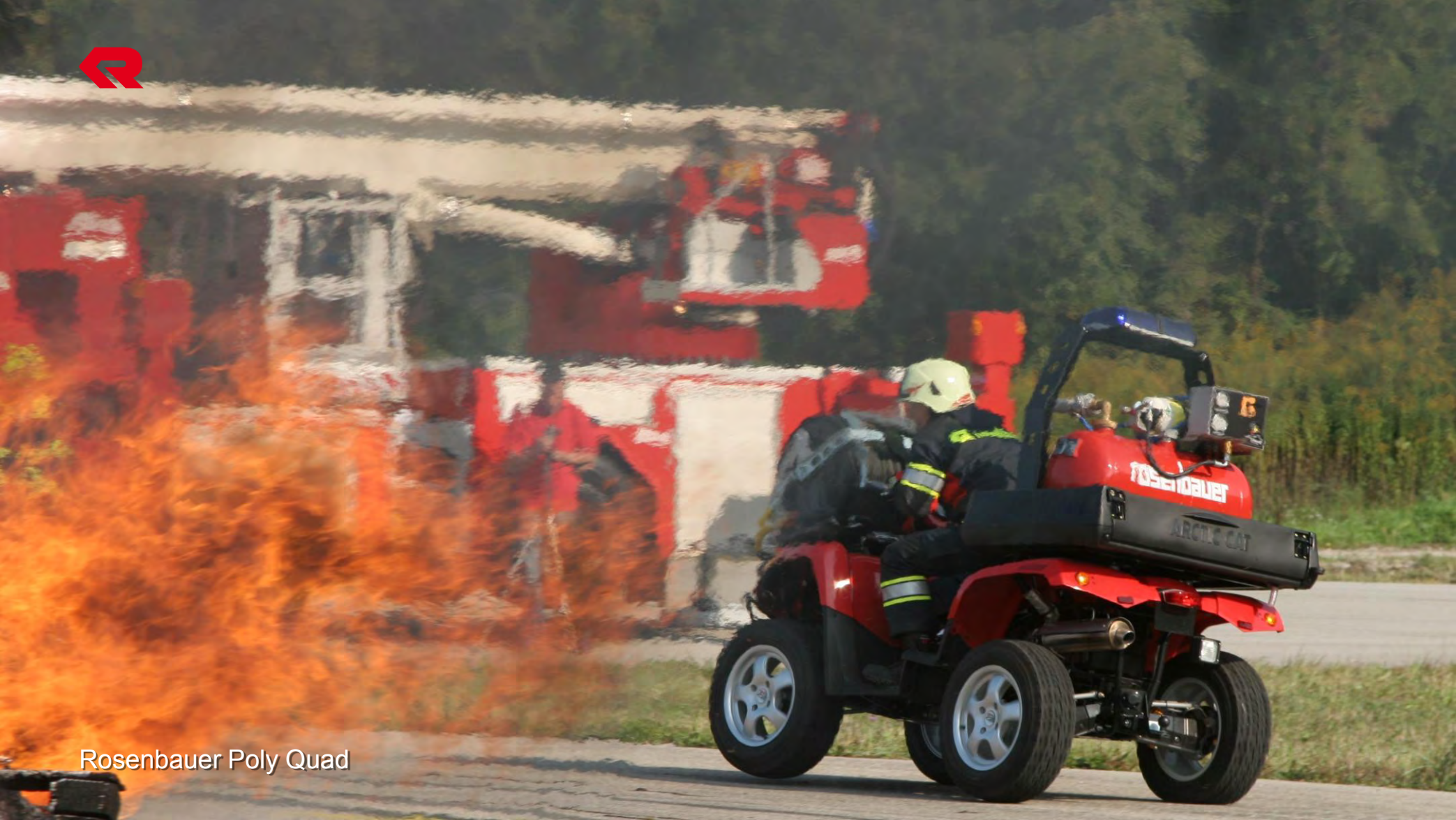
Rosenbauer Poly Quad